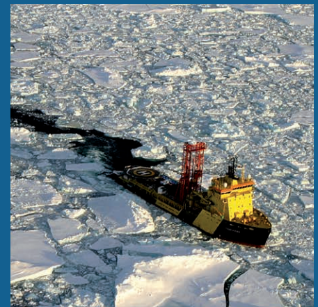
Drillship Vidar Viking during Expedition 302 Arctic Coring (ACEX).