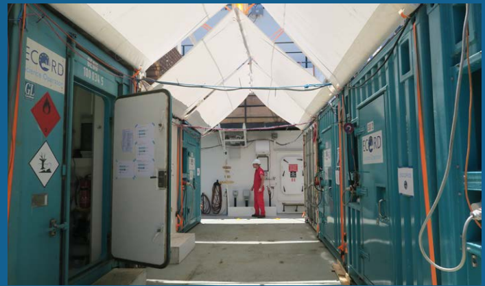
'Main street' between ESO mobile containers aboard Liftboat Myrtle - Exp 364 Chicxulub K-Pg Impact Crater.