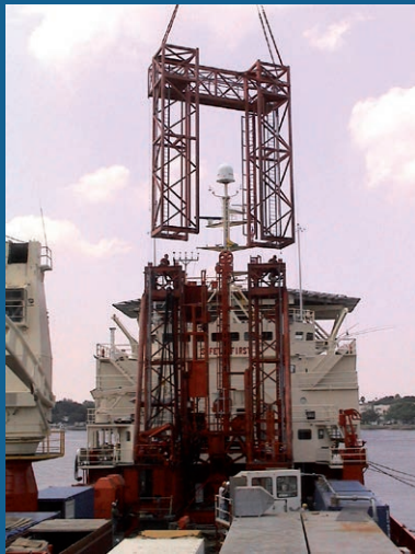
Assembling the derrick onboard the DP Hunter - Exp 310 Tahiti Sea Level.

facilities. The limited space onboard dictates that the emphasis offshore is on acquiring the cores and conducting any ephemeral measurements. The un-split cores are then shipped back to the IODP Bremen Core Repository for the OSP. Consequently, only a few researchers and technicians, under the guidance of the Co-chief Scientists, are required during the offshore phase, with the whole Science Party convening at the OSP.