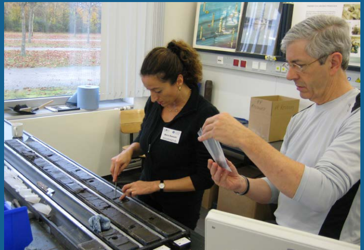
Scientists at the Onshore Science Party - Exp 313 New Jersey Shallow Shelf.

The European Petrophysics Consortium (EPC) is responsible for all logging and petrophysical activities for ESO. This consortium is coordinated by the University of Leicester (UK) and includes the University of Montpellier (France), providing the Petrophysics Staff Scientists, Petrophysicists and technicians for each expedition. See European Petrophysics Consortium leaflet for further details.