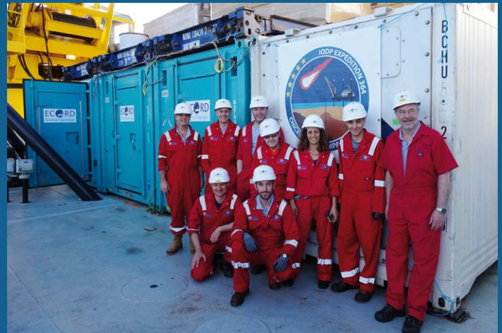
The ESO Team onboard Liftboat Myrtle - Exp 364 Chicxulub K-Pg Impact Crater.