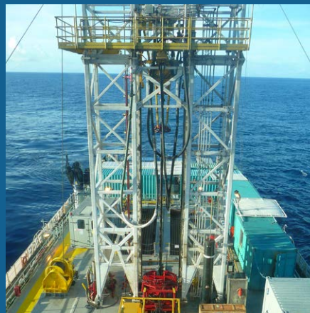
Greatship Maya during Expedition 325 Great Barrier Reef Environmental Changes.