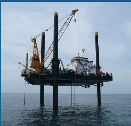
Liftboat Kayd during Expedition 313 New Jersey Shallow Shelf.