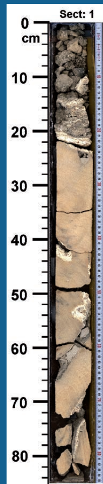
Photograph of a coral core showing massive coral colonies.

coral samples, consistent with shallow, high-energy settings, were taken for subsequent dating and sea-level change investigations.