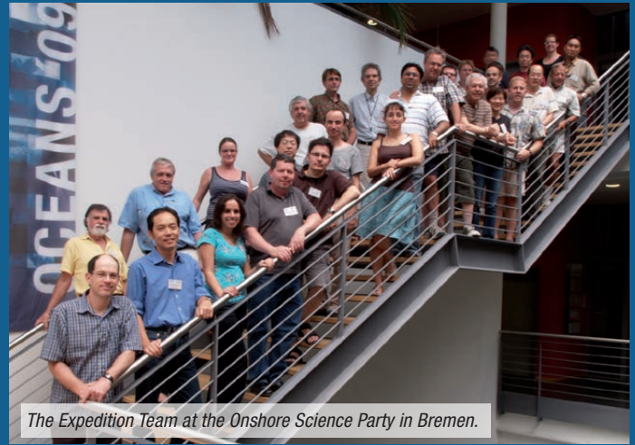
The Expedition Team at the Onshore Science Party in Bremen.

Preliminary U/Th and AMS C14-derived chronology confirms that the recovered cores span the period of interest since the LGM, including comprehensive new coverage of crucial periods