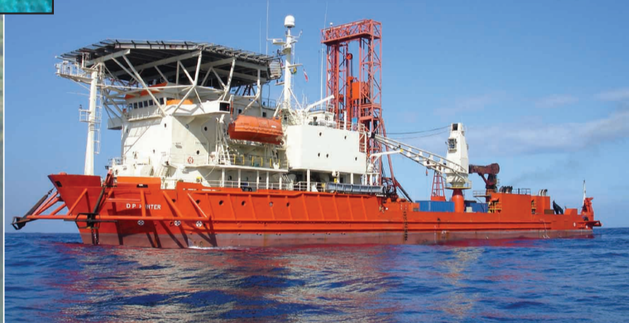
Drillship DP Hunter