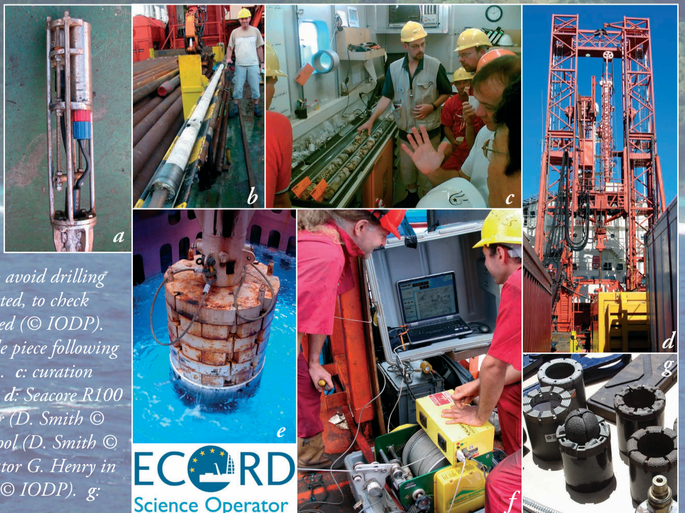
a: this camera was used before drilling to survey the seabed around potential drillsites to avoid drilling into live corals and, after boreholes are completed, to check there has been minimal disruption to the seabed (© IODP). b: continuous 3 metre core recovered as a single piece following the change to using split steel corer (© IODP). c: curation container discussion (M. Koelling © IODP). d: Seacore R100 Rig taken from outside core curation container (D. Smith © IODP). e: DART seabed template in moonpool (D. Smith © IODP). f: logging winch computer and operator G. Henry in rooster box with Seacore personnel (D. Smith © IODP). g: drill bits aboard DP Hunter (© IODP).