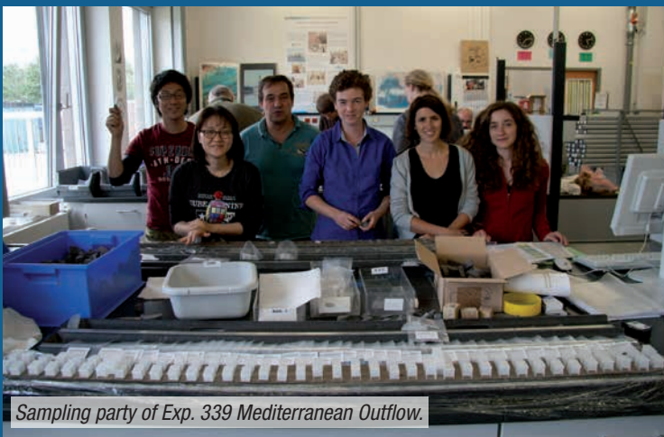
Sampling party of Exp. 339 Mediterranean Outflow.

The BCR was established in 1994 and now stores 155 km of cores acquired during 89 expeditions. Approximately 200 scientists visit the repository annually, sometimes working on the cores in week-long sampling meetings. As many as 70,000 samples per year are taken by visiting scientists and the repository staff. In its 24 years of operation, more than 1,013,787 samples representing almost 4,670 individual requests have been taken and distributed worldwide.