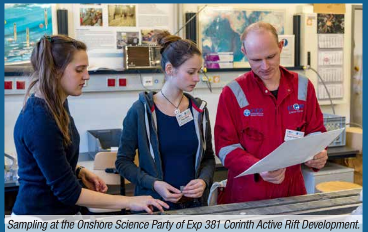
Sampling at the Onshore Science Party of Exp 381 Corinth Active Rift Development.

Cores from present and past scientific ocean drilling programmes are stored in three repositories: