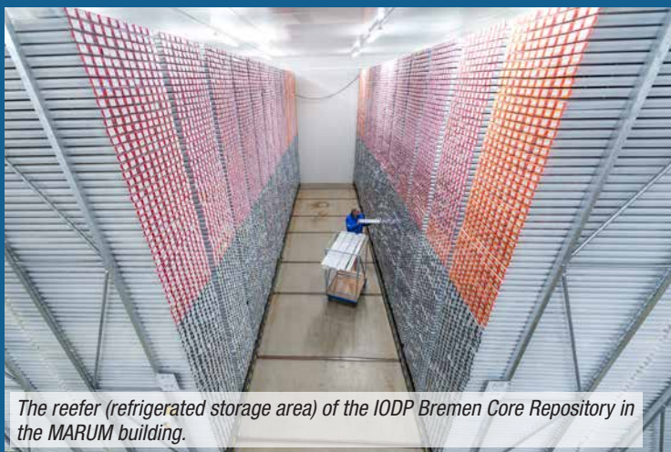
The reefer (refrigerated storage area) of the IODP Bremen Core Repository in the MARUM building.

The IODP Bremen Core Repository (BCR) at the MARUM-Center for Marine Environmental Sciences at the University of Bremen, is one of three core repository facilities worldwide. The BCR has state-of-the-art laboratories, office facilities and a large refrigerated storage area with a movable rack system. The repository provides services to the international community through advanced curation and sampling techniques, database archiving (Drilling Information System, DIS), and participates in a wide range of education and outreach activities.