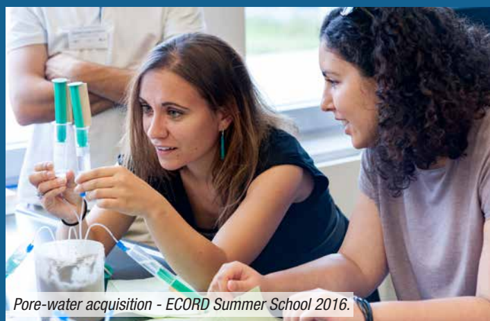
Pore-water acquisition - ECORD Summer School 2016.

The Bremen Core Repository organises Summer Schools and Training Courses, which offer unique opportunities to introduce PhD students and Post-docs to IODP science and operations. The Summer Schools provide a range of teaching, from a general introduction to compiling IODP proposals, to learning about ongoing research within this international programme that encourages young scientists to participate in future IODP expeditions. During the 12-day long courses, the participants are onboard a "virtual ship" where they become acquainted with a wide spectrum of analytical technologies and core description methods, including core logging/scanning, and the high standard of practices that take place during IODP expeditions. This comprehensive approach combining scientific lectures with practical exercises on IODP-style shipboard measurements is the blueprint for a series of summer schools held once a year within the ECORD Summer School programme, each of which addresses a major topic of the IODP Science Plan.