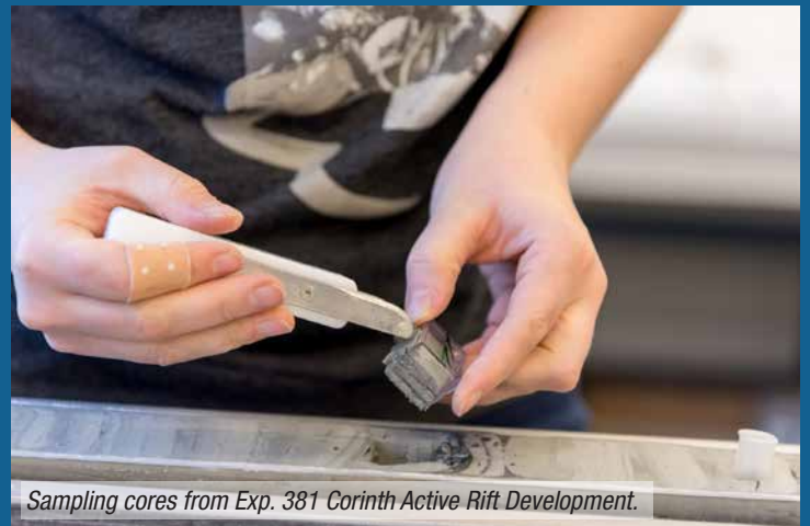
Sampling cores from Exp. 381 Corinth Active Rift Development.

With almost 3,700 visitors from all over the world so far, the repository is an important hub for IODP/ECORD, and the wider scientific community. The BCR significantly contributes to the exchange and transfer of marine science knowledge, leading to invaluable international co-operation and scientific interaction.