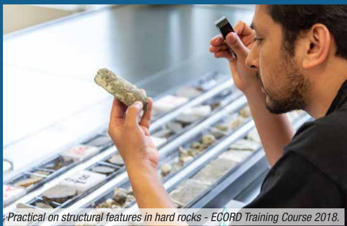
Practical on structural features in hard rocks - ECORD Training Course 2018.

The 5-day ECORD Training Courses focus on the IODP core-flow procedures to prepare the participants for IODP expeditions and instill them with an appreciation for high standards in all kinds of coring projects.