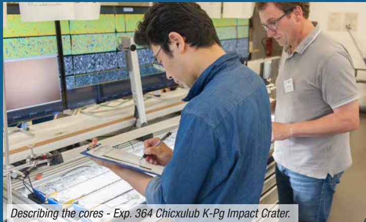
Describing the cores - Exp. 364 Chicxulub K-Pg Impact Crater.

The mission-specific platform (MSP) expeditions operated by ECORD use a variety of specialised platforms to drill in areas that are otherwise inaccessible. This limits in-depth analyses of the cores during the offshore phase, and so most of these investigations are carried out later at an Onshore Science Party (OSP).